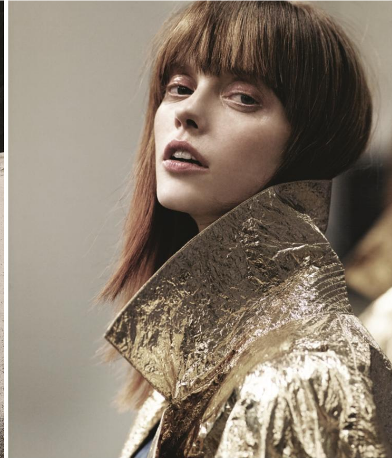
Blouson en agneau plongé or façon papier froissé JITROIS