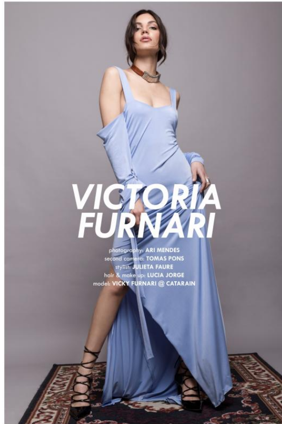
dress NOUS ETUDIONS / necklace BLACKMAMBA / shoes PARUOLO